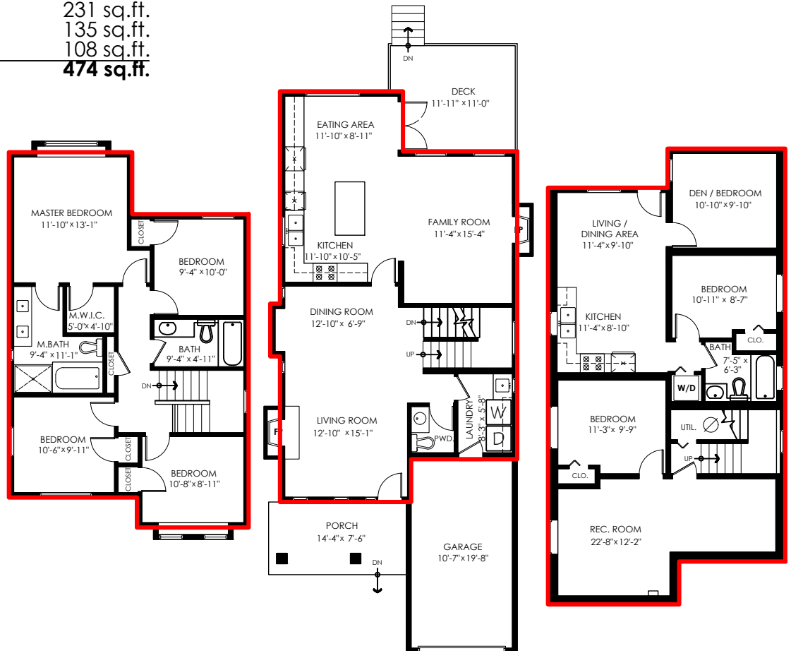
Upper Floor Plan Floor Area: 855 sq.ft. Ceiling Height: 8'